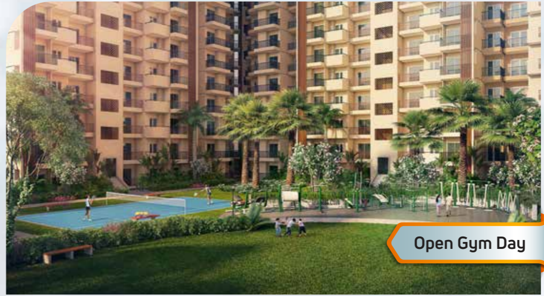
Open Gym Day